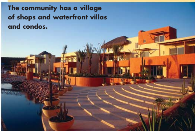
The community has a village of shops and waterfront villas and condos.

For more information, call (866) 207-4612 or visit www.marinacostabaja.com . — Katie Solar